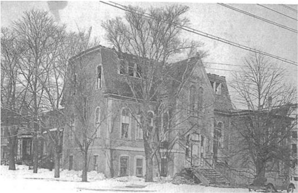
Halifax Medical College, corner College Street and Carlton St. (circa 1900)