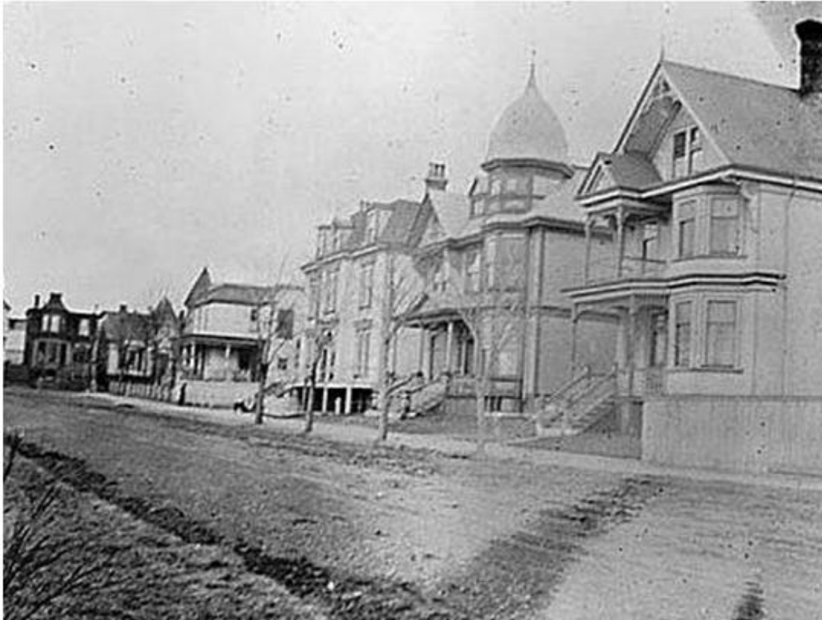
College Street (north side) between Carlton St. and Robie St. (early 1900's)